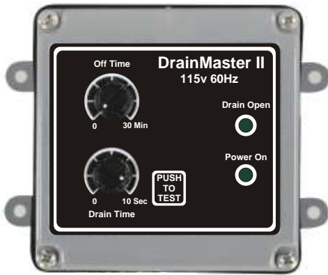
Multi Point Operator KF5051