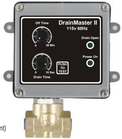
Single Point Assembly KF4050